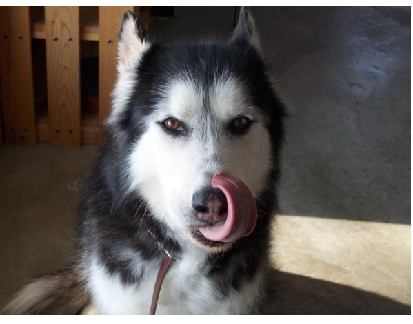
Thanks so much for bringing your beloved pets for lodging & training here!